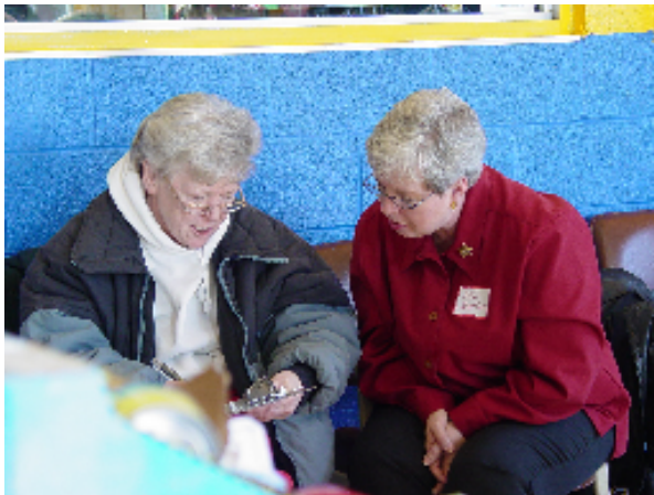
A Car Care hostess getting to know a car owner.

Car Care Saturday Church of the Redeemer PO Box 3365 Monroe, NC 28111